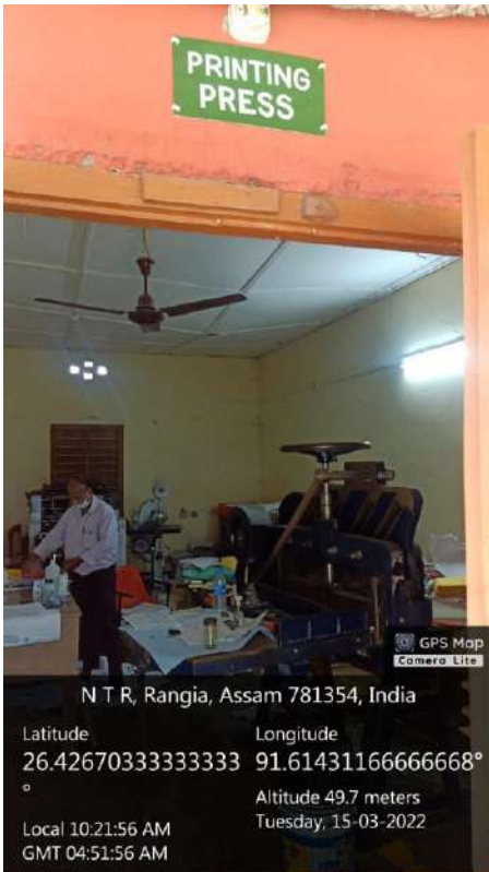
N T R, Rangia, Assam 781354, India Latitude 26.426703333333 Longitude 91.61431166666668° Altitude 49.7 meters Local 10:21:56 AM Tuesday, 15-03-2022 GMT 04:51:56 AM